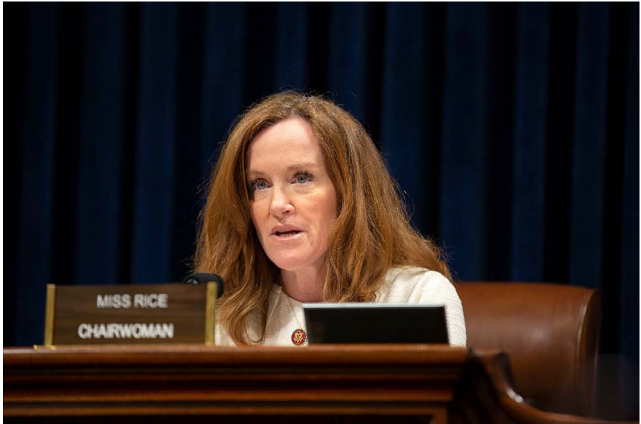
Kathleen Rice

Having built name recognition in Nassau County as Long Island's first female district attorney, Rep. Kathleen Rice is about to start her fourth term representing New York's 4th Congressional District. As part of the New Democrat Coalition, she's aimed to reform the Democratic Party by bringing progressives and traditionalists together. Rice has advocated for a national plan to fight the coronavirus and remains outspoken on the need for economic stimulus.