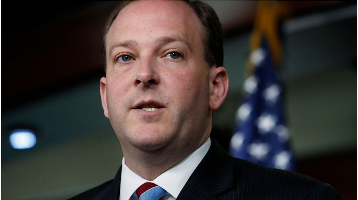
Rep. Lee Zeldin.

lee-zeldin-Jacquelyn-Martin-AP-Shutterstock-web-only.jpg