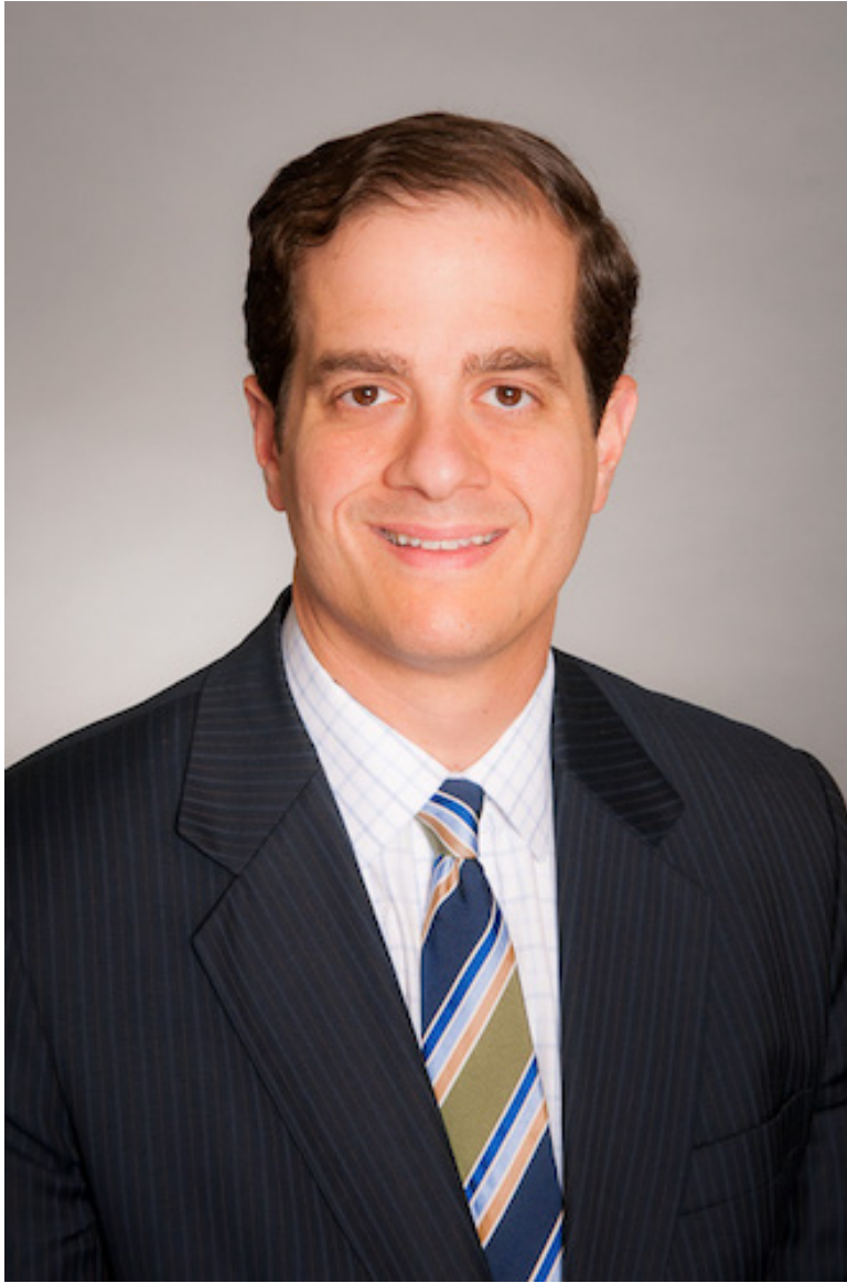
Thomas Falcone ( LIPA )

As CEO of the Long Island Power Authority, Thomas Falcone is responsible for the electrical grid that serves more than a million Long Islanders. As pandemic-related unemployment continues to plague Long Island and utility bills go unpaid, Falcone has planned for larger write-offs while emphasizing that LIPA can absorb the losses. This fall, Falcone led LIPA in celebrating its new $25 million energy and nature center at Jones Beach.