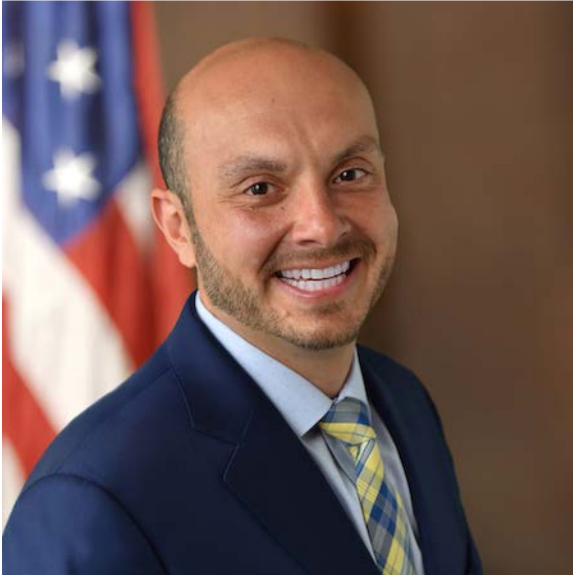
Andrew Garbarino ( Andrew Garbarino )