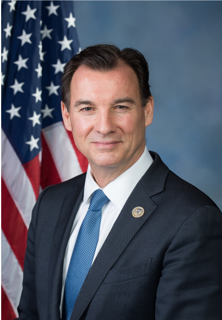
Rep. Thomas Suozzi

Rep. Thomas Suozzi had a minor scare when Republican challenger George Santos pulled ahead on Election Day, but the former Nassau County executive and current representative of New York's 3rd Congressional District came out ahead once absentee ballots were counted, and he declared victory in mid-November. The vice-chair of the bipartisan House Problem Solvers Caucus, Suozzi has been calling for further stimulus measures and has distributed thousands of masks in his district.