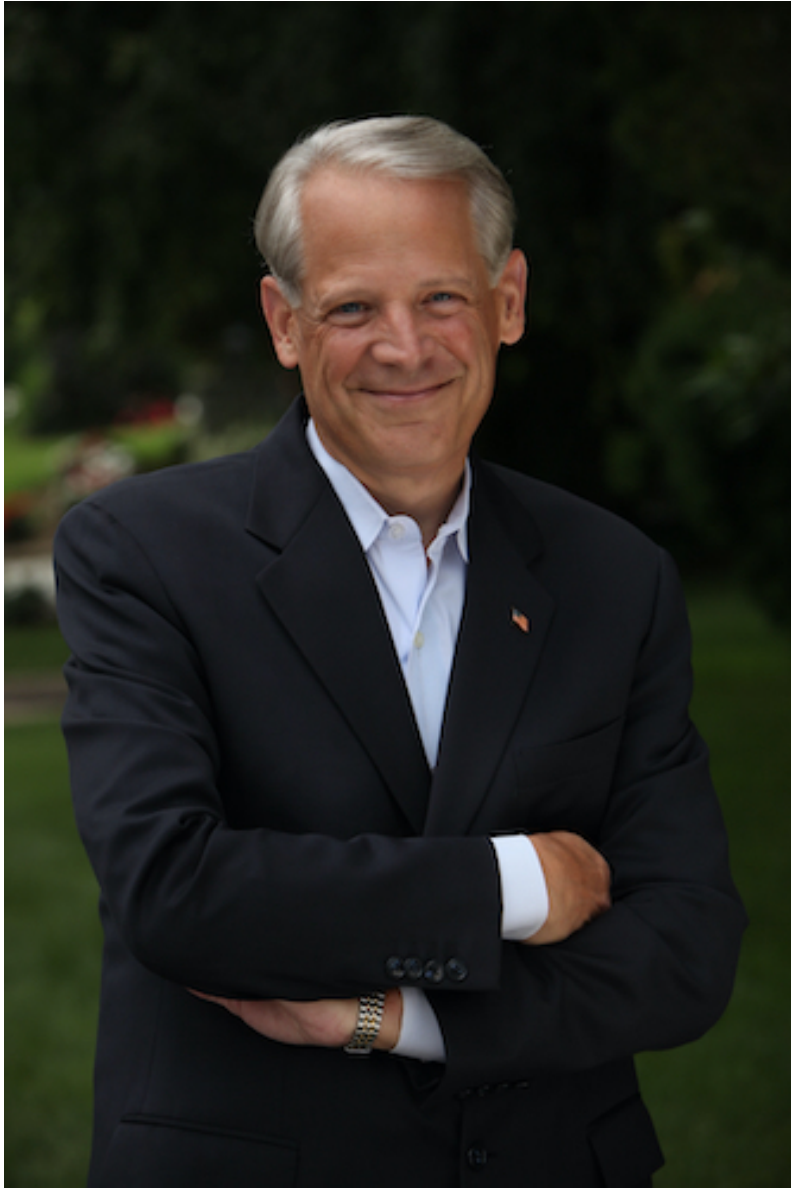
Steve Israel ( Steve Israel )

In his role as director of Cornell University's Institute of Politics and Global Affairs, Steve Israel is known for gathering top politicians and leaders to engage in nonpartisan conversations of global importance. The author and former congress member's Long Island roots and bipartisan attitude color his columns for The Hill and guest appearances on cable TV. Israel also remains plugged into Democratic networks, recently advising the Biden campaign on suburban voters.