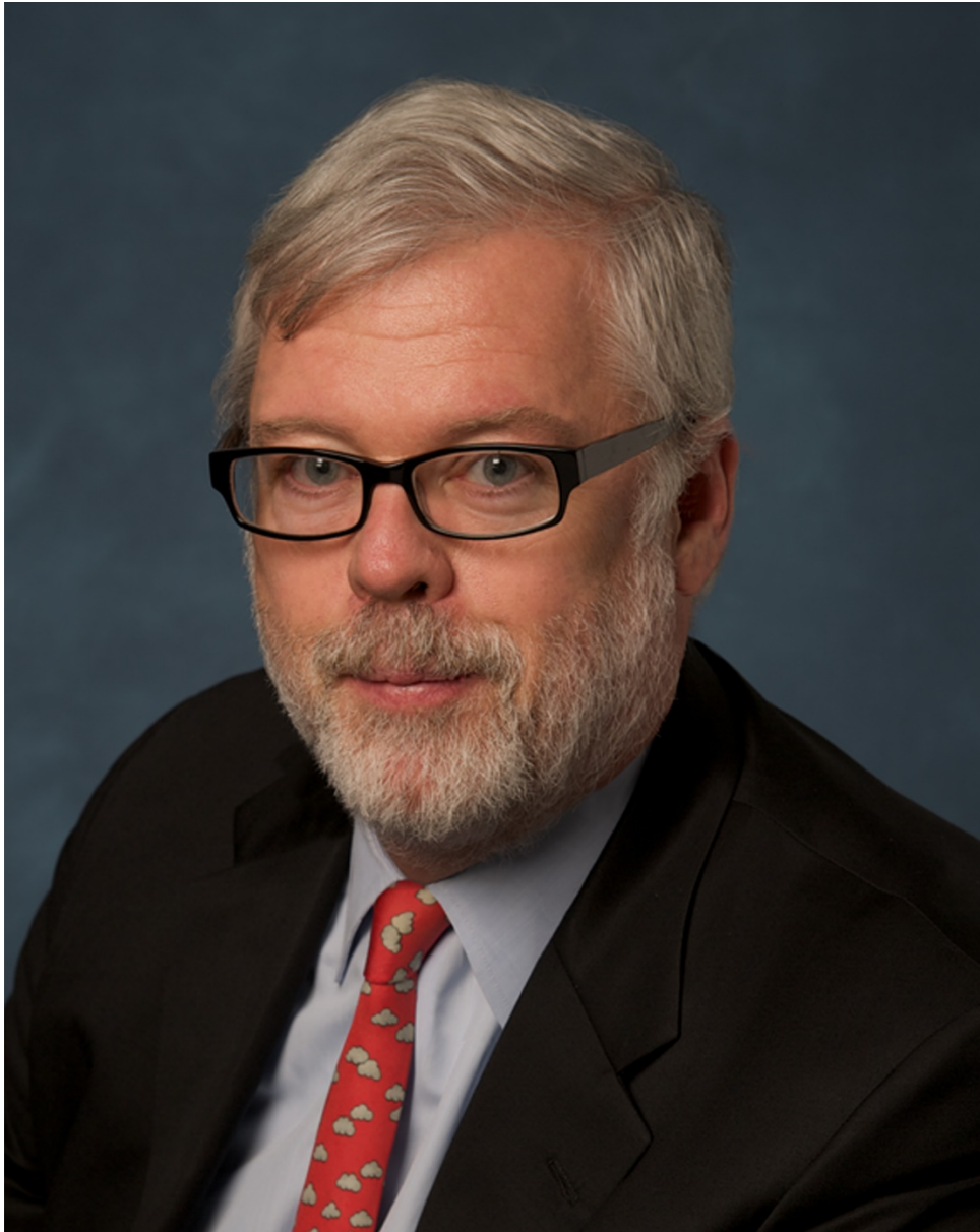
Port Authority of New York and New Jersey