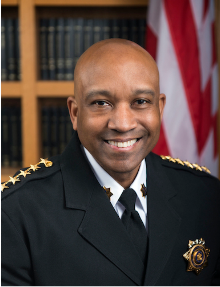
Errol Toulon ( Suffolk County Sheriff's Office )

Errol Toulon - Suffolk County Sheriff's Office.jpg