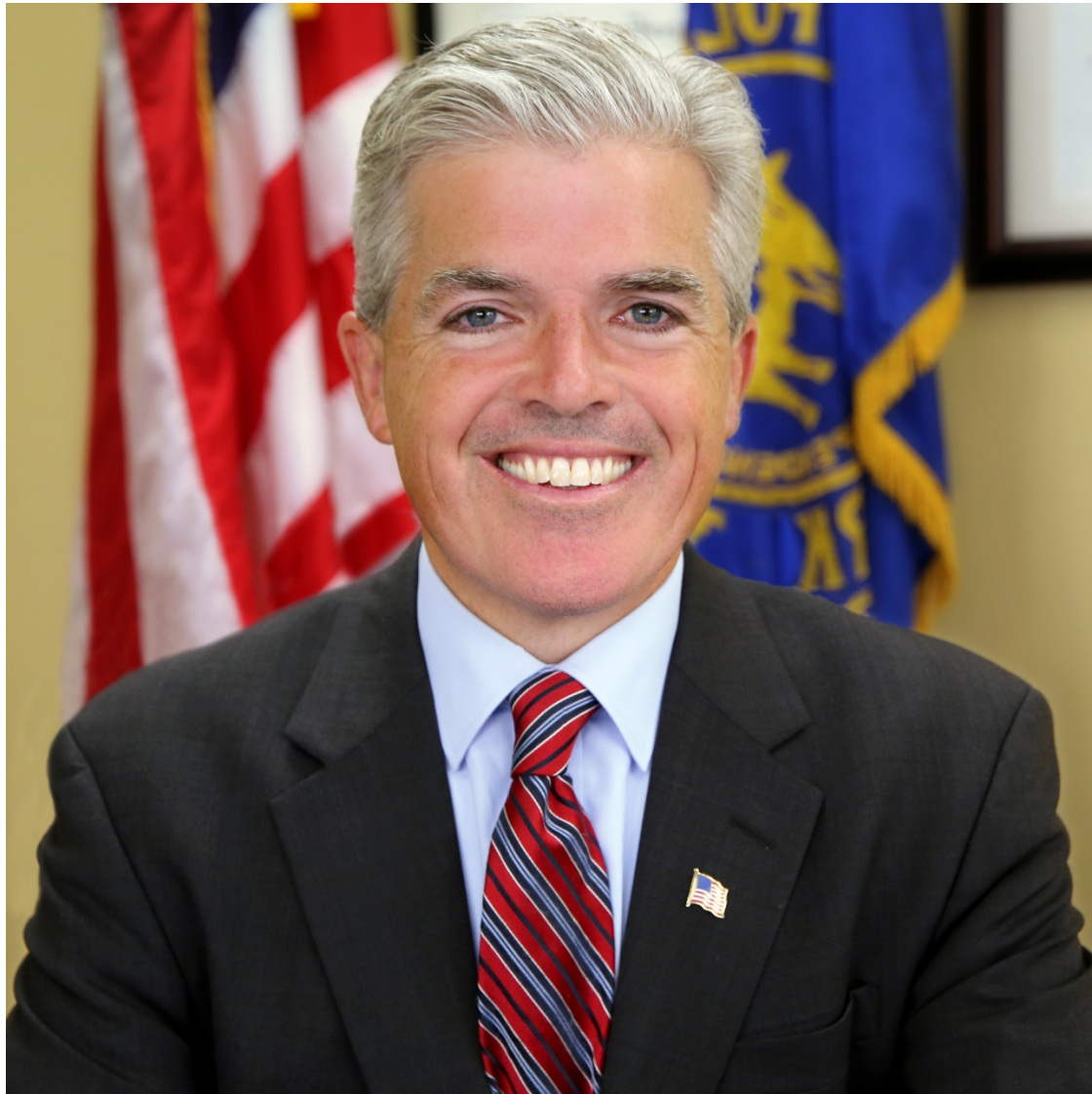
Suffolk County Executive's Office